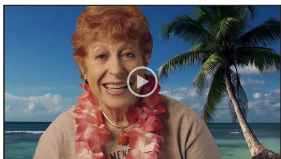
Music Mends Minds Presentation at the Rotary International 2020 Virtual Convention

ADRAG is an action group focused on bringing attention to the growing epidemic of neurocognitive diseases, specifically Alzheimer’s and dementia. MMM is a resource partner and we share a mission to spread awareness and educate about research regarding Alzheimer’s and dementia. As an active member of their global board, I was scheduled to be a speaker at the Annual International Rotary Convention in Hawaii - June 2020, now cancelled. Instead, our MMM video, which features our history and vision, and our new global music-making platform on Zoom, was included during the ADRAG presentation at the Rotary International 2020 Virtual Convention. Please enjoy the video, and share with your outreach!