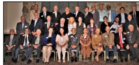
Westwood Village Rotary Club

As a refresher, Rotary is a global service organization with over 33,000 clubs in 200+ countries, with over 1.2 million members. Fourteen of the 19 MMM bands have been formed by Rotary Clubs. MMM has partnered with two global arms of the International Rotary Organization: one is called Alzheimer’s Dementia Rotary Action Group (ADRAG) and the other is International Fellowship of Rotarian Musicians (IFRM). See our Rotary tab on our website HERE!