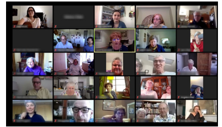
A snapshot of one of our Zoom sessions!

Due to the COVID-19 pandemic, MMM bands across the world sadly had to shut the doors to all in-person rehearsals and sing-a-longs. In light of this, MMM has moved to online sessions through Zoom led by our Board-Certified Music Therapist, three times a week. Our seniors, their families, and caregivers can join us for music-making and socialization from the comfort and safety of their own homes!