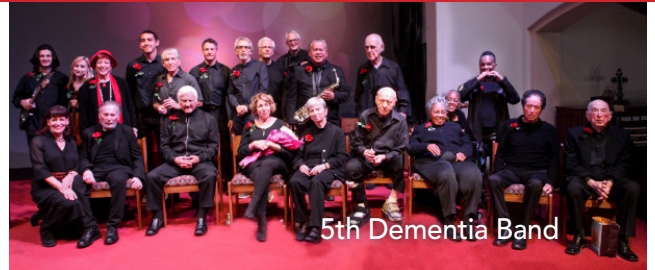
5th Dementia Band

Music Mends Minds is a 501(c)(3) nonprofit that creates musical support groups, bands and sing-a-longs for patients with Alzheimer's, dementia, Parkinson's, as well as traumatic brain injury, stroke and PTSD. Research shows that music memory remains intact in these patients, in spite of the disease process, offering a beneficial and therapeutic experience for our members, families, caregivers and the entire community. ALL are welcome to come and join in the fun, using the power of music to change brain chemistry and celebrate life!