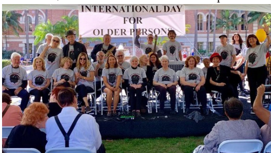
MMM's "5th Dementia" Band at USC

On December 14th, MMM will be represented at the Michael J. Fox Foundation's "Parkinson's IQ + You" Conference in Anaheim, CA. This event will increase public understanding of Parkinson's care and research, and MMM will educate attendees on the physical, emotional, and mental benefits of music for Parkinson's patients.