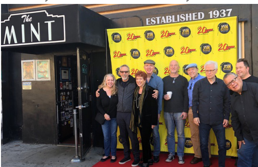
Studio City "Jazzanova" at The Mint LA