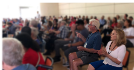
Beverly Hills "Treblemakers" at a Weekly Rehearsal