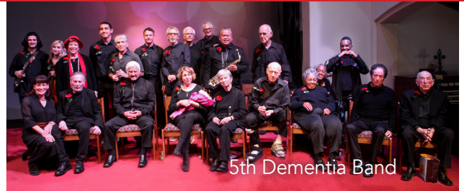
5th Dementia Band

Music Mends Minds is a 501(c)(3) nonprofit that creates musical support groups, bands and sing-a-longs for patients with Alzheimer's, dementia, Parkinson's, as well as traumatic brain injury, stroke and PTSD. Research shows that music memory remains intact in these patients, in spite of the disease process, offering a beneficial and therapeutic experience for our members, families, caregivers and the entire community. ALL are welcome to come and join in the fun, using the power of music to change brain chemistry and celebrate life!